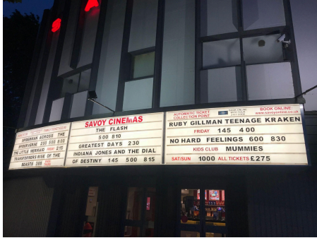
Savoy Nottingham’s Billboard Change to LED Lighting, June 2023