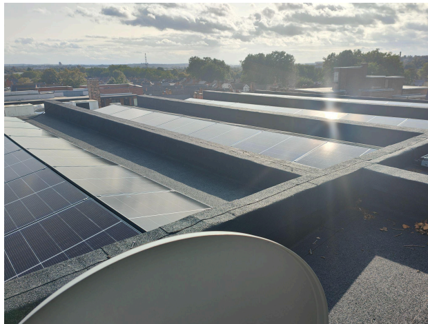
Solar Panels at Savoy Nottingham, August 2023

Savoy has installed solar panels at its cinemas in Nottingham and Boston and is rolling out further installations at their other sites over the next 2 years. At Boston, they have also installed a significant number of batteries. One of the considerations when installing solar panels in cinemas, is that cinemas use most of their energy during dark hours, when the sun is not shining. We are working to assess how best to use battery storage for power during the nighttime.