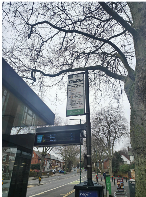
Savoy Cinema Bus Stop (LE09)

Commuting and car sharing is another area where we encourage our staff to make sustainable choices. We recognise that transportation is a major contributor to greenhouse gas emissions, and we encourage our staff to use public transportation, carpool, or bike to work whenever possible. We also provide incentives for staff who choose to carpool or use alternative modes of transportation. Savoy Cinema in Nottingham, in particular, has its own 'Savoy Cinema' bus stop which the NCTX Orange Line passes very regularly, as well as others including the Indigo, i4, 18 and the L2 Local Link Bus, which our staff and customers often use.